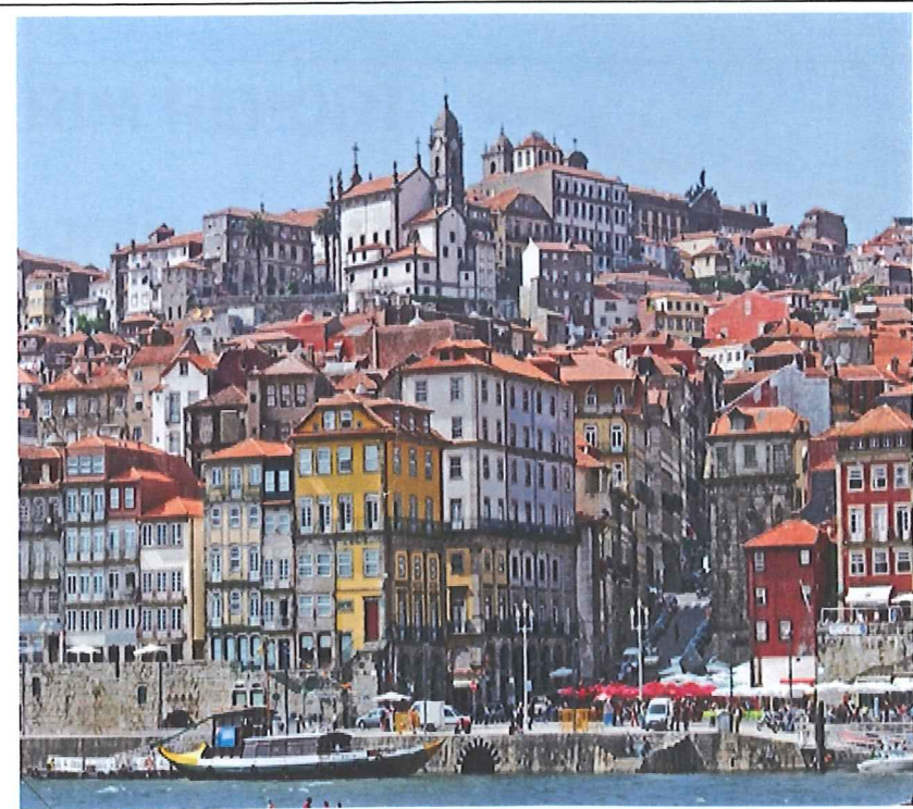
PORTO (Oporto) (OLD TOWN)

Appraisal of the 4 actions developed by the school, (“cross-actions” outcomes, outcomes per action) // Appraisal of the development of each action // Identification of new development opportunities// Identification of possible constraints to school development