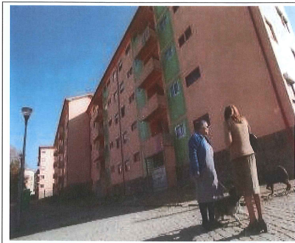
PORTO (Oporto) ('CERCO' District)